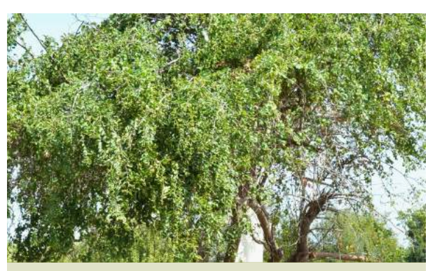
Scientific name: Ziziphus spina christi Common name: Sidr Tree, Christ's Thorn Tree, Jujube

The Ghaf Tree is a tall, drought-tolerant evergreen native tree found along streets and gardens. It has drooping branches, small grey-green leaves and produces tiny yellow flowers on spikes from March to May and October to January.