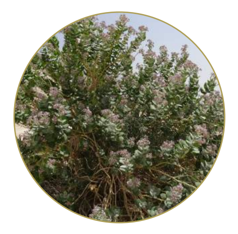
Sodom's Apple Tree