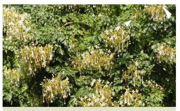
Scientific name: Milingtonia hortensis Common name: Indian Cork Tree

An ornamental flowering plant native to the American tropics, the Geiger Tree is a drought tolerant plant. About 3-7.5 m. tall, it has dark green oval shaped leaves and bright orange tubular flowers.