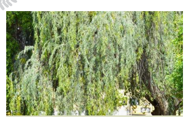
Scientific name: Prosopis cineraria Common name: Ghaf Tree

The Ghaf Tree is a tall, drought-tolerant evergreen native tree found along streets and gardens. It has drooping branches, small grey-green leaves and produces tiny yellow flowers on spikes from March to May and October to January.