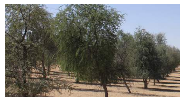
Prosopis cineraria (Ghaf)