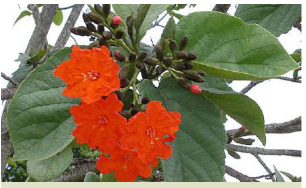
Scientific name: Cordia sebestena Common name: Geiger Tree, Scarlet Cordia

The Neem Tree is a tall evergreen tree with innumerable medicinal uses. It has a straight trunk, bright green alternate leaves consisting of several leaves with serrated edges. It produces small white blossoms in the Spring season, followed by small, ovoid shaped yellow fruit.