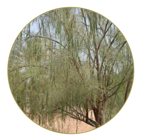
Wild Drumstick Tree