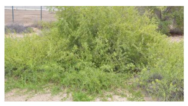
Salvadora persica (Miswak, Toothbrush Tree)