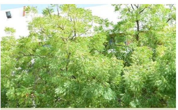
Scientific name: Azharidacta indica Common name: Neem Tree

The Sidr Tree is about 7-8 m. tall and sturdy, with shiny ovate leaves, and yellowish to orange edible oval fruit with a single stone like the olive.