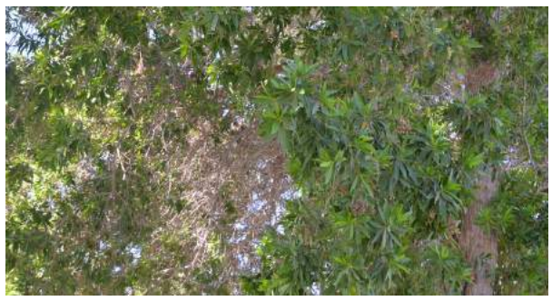
Conocarpus species (Damas)