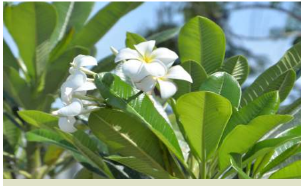
Scientific name: Plumeria alba Common name: Frangipani

The Indian Cork Tree is tall with a straight trunk, very few branches and ornamental leaves. It has very fragrant white trumpet shaped clusters of flowers that hang down on straight stalks.